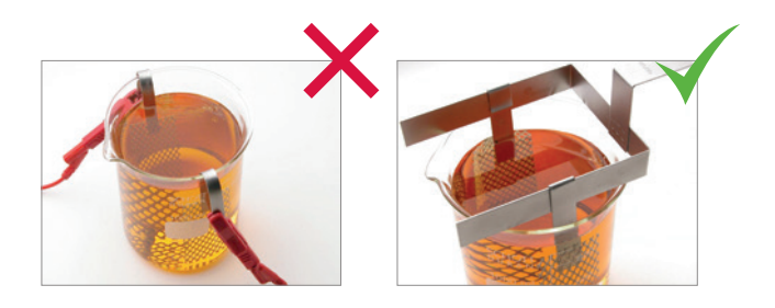
Features of Umicore beakerglass anodes are: easy handling, replaceable anode-segments.